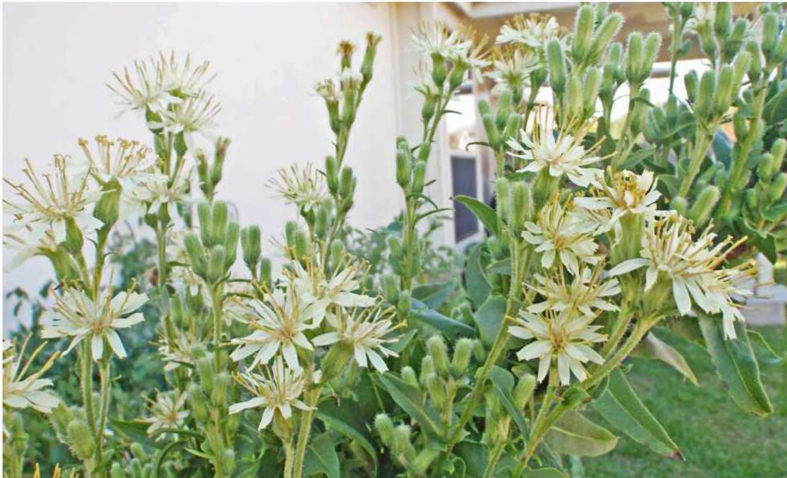
Figure 1. Prenanthes aspera (Singhurst 18337, BAYLU), garden grown from collection in Bowie County.